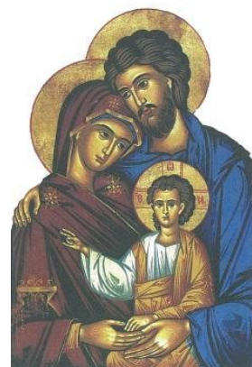
Synod on the Family