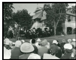
People gathered outside the presbytery for Blessing of the extension of Church in 1959