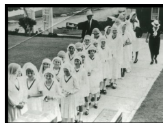
Confirmation children from 1930s