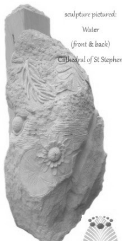
sculpture pictured: Water (front & back) Cathedral of St Stephen