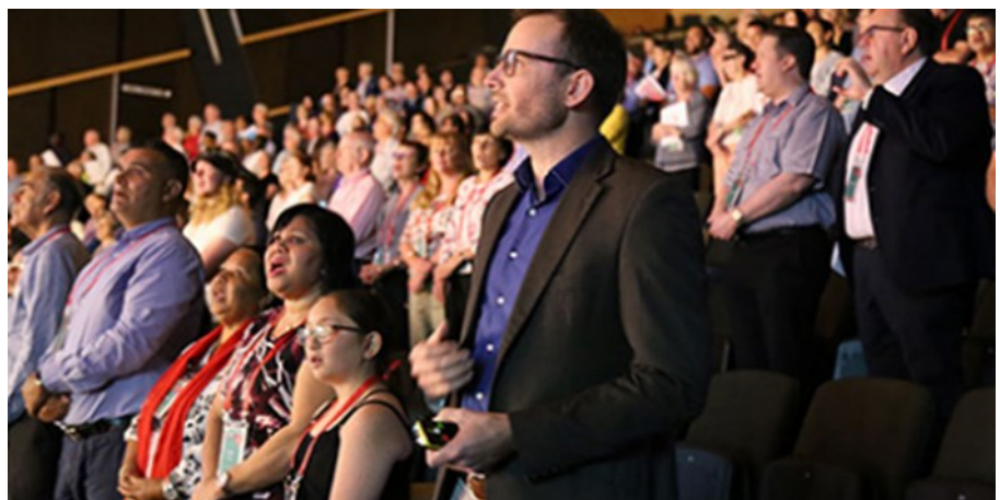
Recent Brisbane Assembly - watch this space...