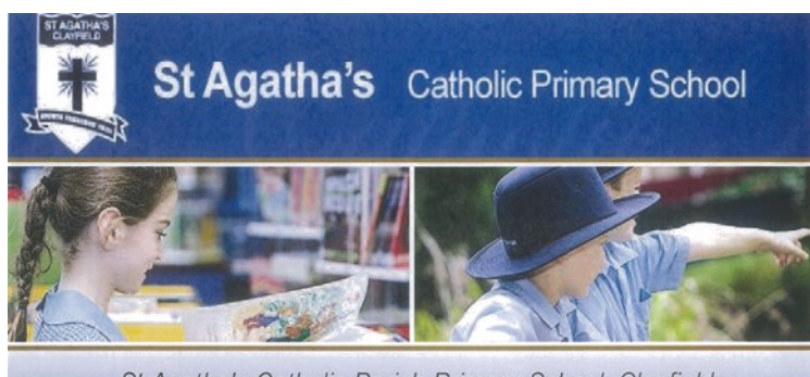
St Agatha's Catholic Parish Primary School, Clayfield is a community that values:

Followed by a Disco and BBQ 5.30pm - 8.00pm Bookings will open soon.