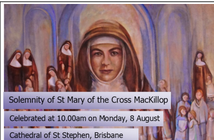
Solemnity of St Mary of the Cross MacKillop