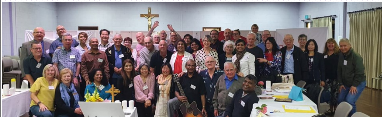
ME National Meeting (Perth)