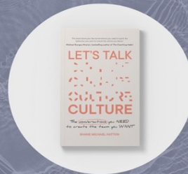
HIS BESTSELLING BOOK Let's Talk Culture - The Conversations You Need to Create The Team You Want

JOIN US FOR THE FIRST ALPHA CATHOLIC CONFERENCE!