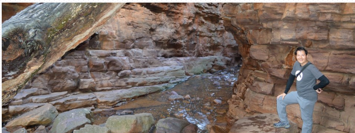
Mt Remarkable NP – Alligator Gorge (Adelaide)

As I said this weekend we'll be announcing the Mass changes across all masses. We'll be verbally making the announcement at Mass and next week we'll provide a transcript for you to read. As you all know this has been a difficult decision to make and I have deliberated and prayed over constantly. I would like to reiterate that let's continue our best to support each other in this process. Let's try to focus on moving forward and not been stuck in past mindsets. Let's look for opportunities and not negatives to draw on each other's gifts and support every member of each mass community to manage these changes. It's has been an incredibly unsettling time for all of you and our parishes and I hope this is a step towards being more stable and moving towards growth and life.