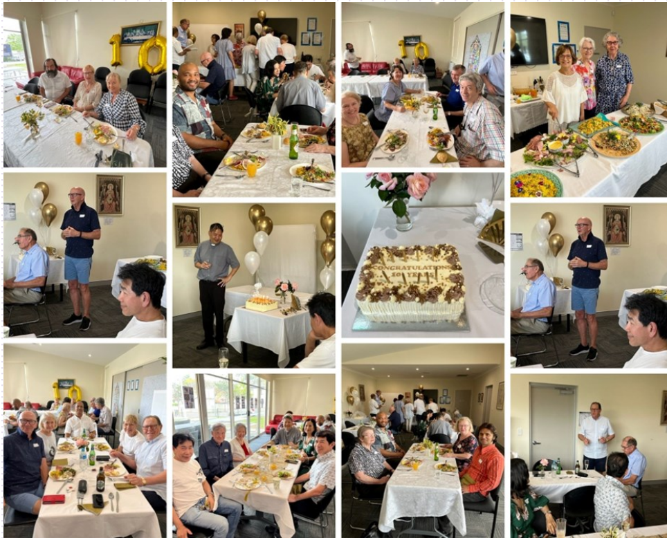
10 th Anniversary of Priesthood Lunch at Hendra.