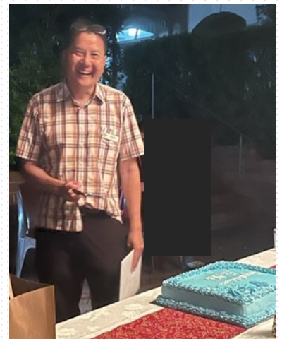
Photos from St Agatha's volunteer thank you event on Friday night.