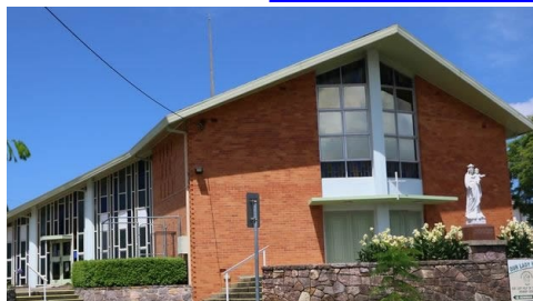
Our Lady Help of Christians Church 9 Bowman Street, Hendra