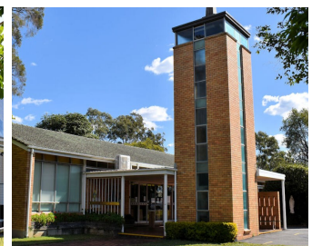
St John's Church 688 Nudgee Road, Northgate