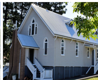
St Cecilia's Church 30 College Street, Hamilton