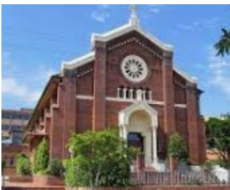
St Agatha's Church 52 Oriel Road, Clayfield