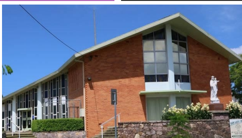
Our Lady Help of Christians Church 9 Bowman Street, Hendra