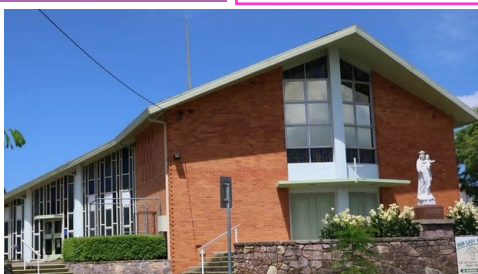
Our Lady Help of Christians Church 9 Bowman Street, Hendra