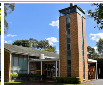
St John's Church 688 Nudgee Road, Northgate