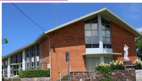
Our Lady Help of Christians Church 9 Bowman Street, Hendra