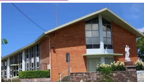
Our Lady Help of Christians Church 9 Bowman Street, Hendra