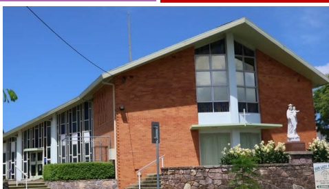
Our Lady Help of Christians Church 9 Bowman Street, Hendra