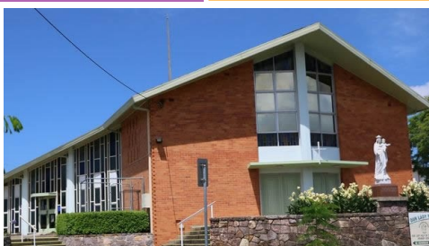
Our Lady Help of Christians Church 9 Bowman Street, Hendra