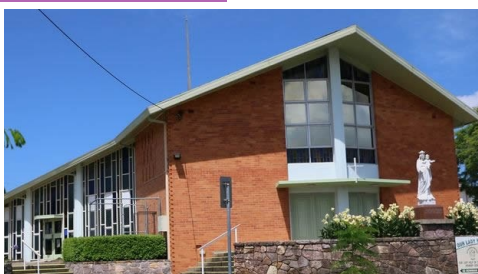
Our Lady Help of Christians Church 9 Bowman Street, Hendra