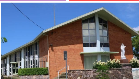
Our Lady Help of Christians Church 9 Bowman Street, Hendra