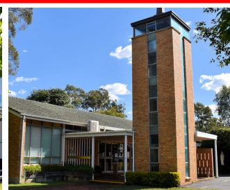
St John's Church 688 Nudgee Road, Northgate