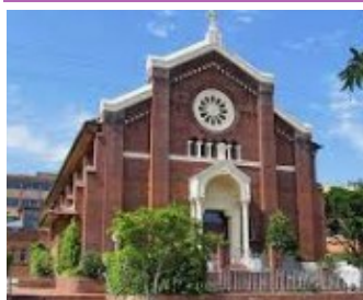
St Agatha's Church 52 Oriol Road, Clayfield

The Annual Catholic Campaign will be held THIS weekend 23/24 August. Donation envelopes are available on the pews. Please take one home and return next week or drop into the letter box – please ensure the envelope is securely sealed. Or donate via the QR Code on the front of the envelope.