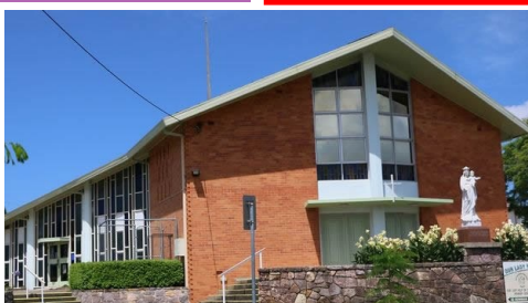
Our Lady Help of Christians Church 9 Bowman Street, Hendra