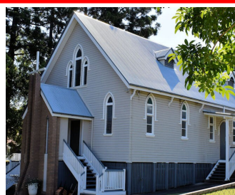
St Cecilia's Church 30 College Street, Hamilton