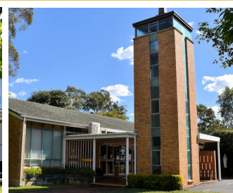
St John's Church 688 Nudgee Road, Northgate