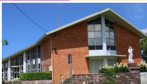
Our Lady Help of Christians Church 9 Bowman Street, Hendra