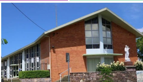
Our Lady Help of Christians Church 9 Bowman Street, Hendra