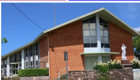
Our Lady Help of Christians Church 9 Bowman Street, Hendra